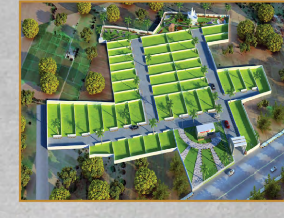
GOVINDA GREEN PLOTS & HOUSES PREMIUM RESIDENTIAL PLOTS INFRONT OF AIIMS AT G.E ROAD RAIPUR