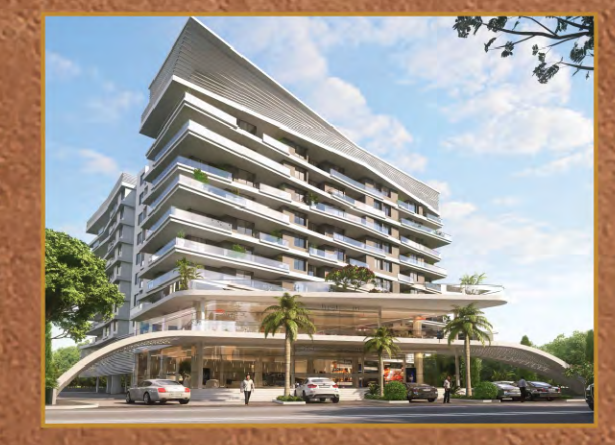
ARCHEE'S EMPORIO 3 & 4 BHK SITE: BHATAGAON, RING ROAD NO. 1 RAIPUR(C.G)