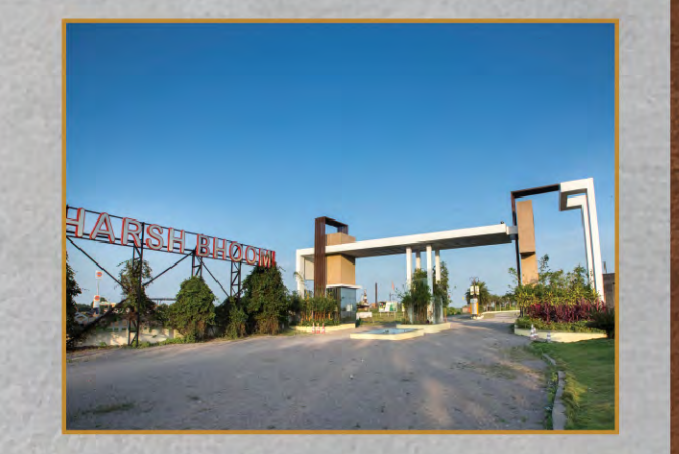
HARSH BHOOMI PLOTS & HOUSES SITE: NEAR DPS SCHOOL VIDHAN SABHA ROAD, RAIPUR(C.G)