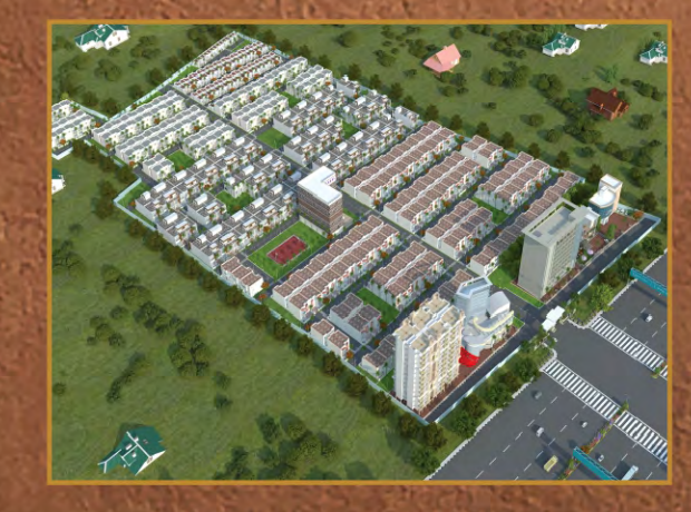
ARCHEE ICON CITY PLOTS & HOUSES SITE: SIMGA, RAIPUR-BILASPUR NATIONAL HIGHWAY(C.G)