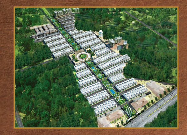
HARSHIT HARMONY PLOTS & HOUSES SITE: GUMA, NEAR HEERPUR CHOWK, RAIPUR(C.G)