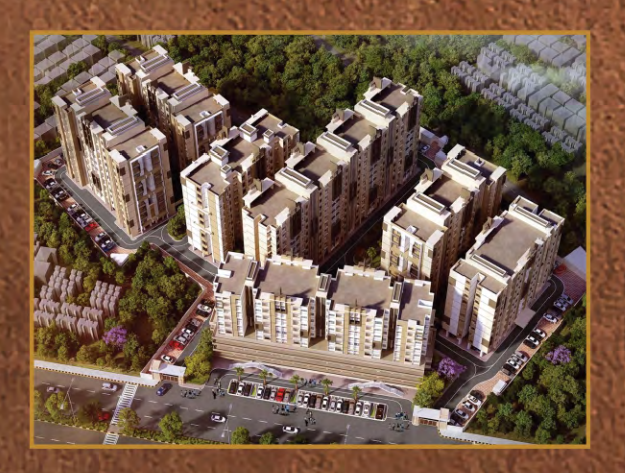
HARSHIT LANDMARK FLATS 1,2,3&4 BHK SITE: NEAR HEERPUR CHOWK, RING ROAD NO. 2, RAIPUR(C.G)