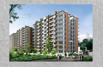
HARSHIT ICON CITY PHASE II