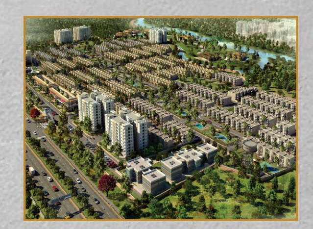
PLOTS & HOUSES SITE: SIMGA, RAIPUR-BILASPUR NATIONAL HIGHWAY(C.G)