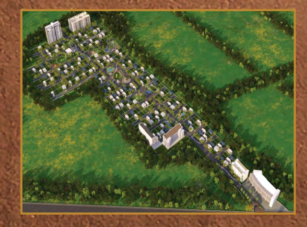
HARSHIT NEO CITY PLOTS & HOUSES SITE: AMLESHWAR, MAHADEV GHAT ROAD, RAIPUR(C.G)